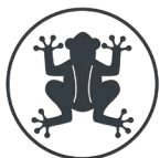
Frog Eco Lodge